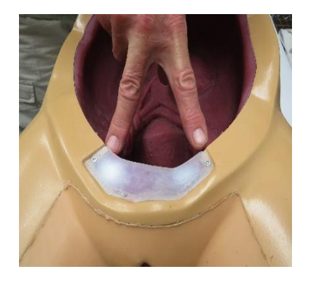
Insert quick release pin through frame