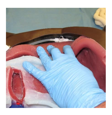
Align anchor posts with holes