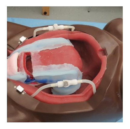
Tuck tubes behind tissue