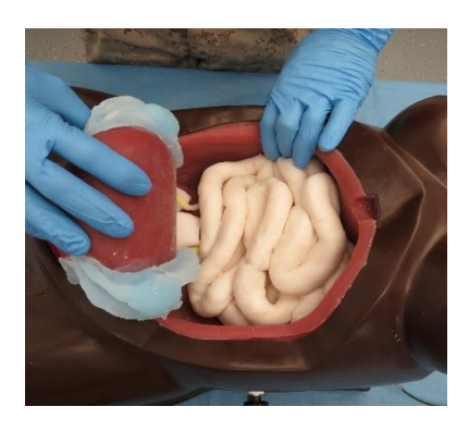
Location of placement of attachment points