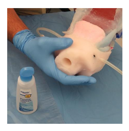
Insert blood tube from uterus Into hole