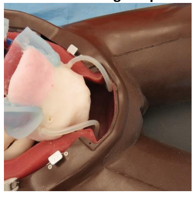
(Post Partum Hemorrhage Simulator)