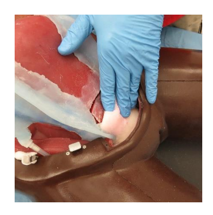
seat the uterus