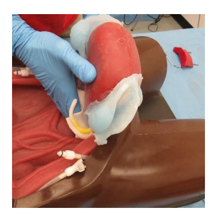
Check that tube is not kinked