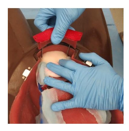
Attach with T9 torx screws. Do not cross threads or overtighten.