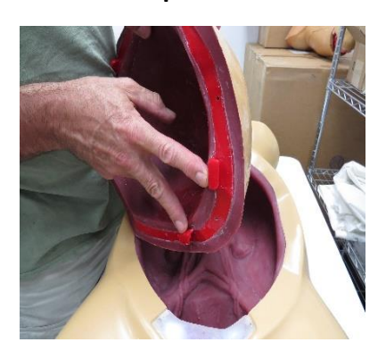
Position abdominal wall, slide attachment points under location of placement.