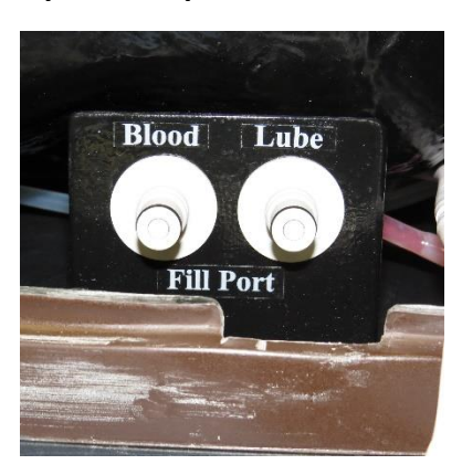
Snap connect to fill port