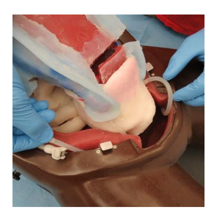
Push uterus into pelvis