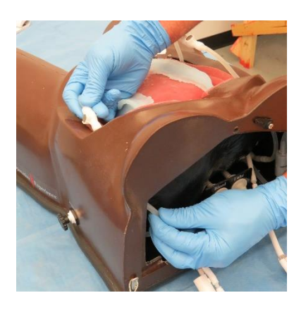
Position uterine/pelvic anchor